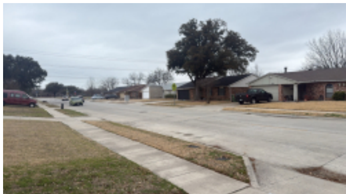
STREET VIEW RIGHT