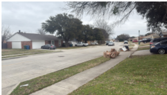
STREET VIEW LEFT